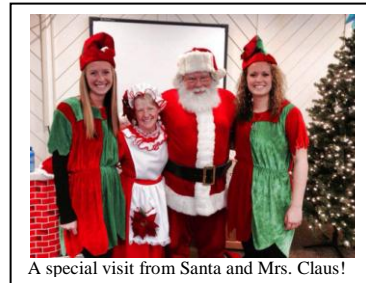
A special visit from Santa and Mrs. Claus!