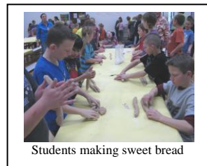
Students making sweet bread

We also did the "Bread in the Bag". The students learn about wheat from Idaho and how to make sweet bread. It always makes our school smell so good with that sweet smelling bread cooking.