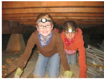
Artifact Search in Egyptian Tomb

We completed ISAT Testing on May 10 th . We appreciate the hard work of students and staff. We are proud of each individual effort.