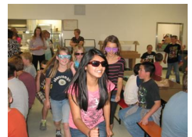
6 th Grade Lunchroom Flash Mob Singing and Dancing