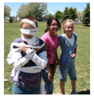
Mummy Wrap Relay