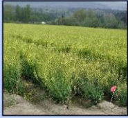
Brussels Sprouts Seed - Clallam County