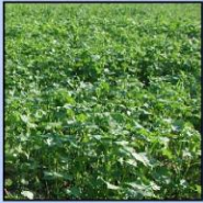
Buckwheat - Franklin County